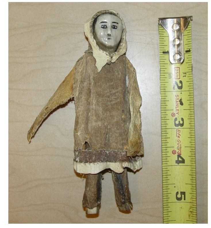
Antique whalebone doll – a mere 5 inches long.

Bert and Grace Poloson —antique oil lanterns, tools, and fishing/marine items.