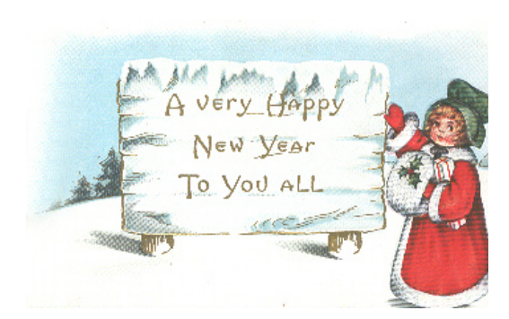
1911 Holiday card; from Museum collection

(THEN PLEASE MAIL ABOVE APPLICATION TO MIRACLE OF AMERICA)