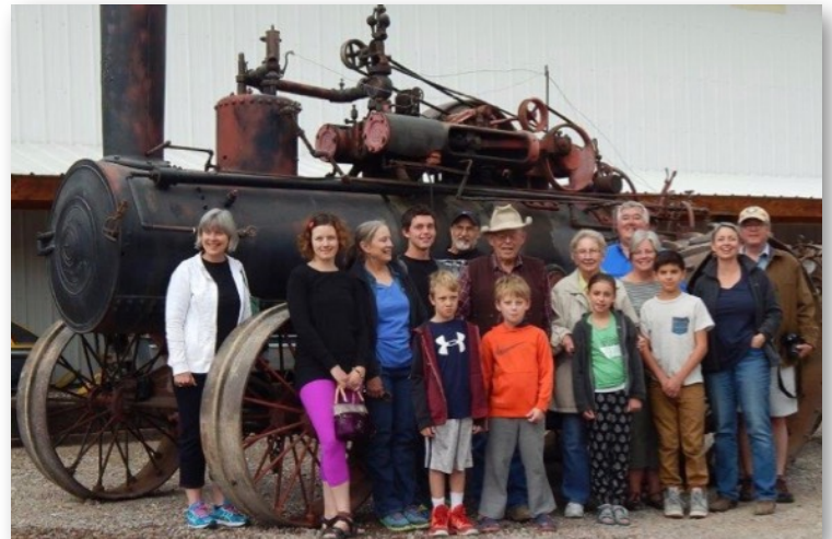
A four-generation family enjoying the museum together.

We are stable and have no indebtedness. Operating expenses are covered by our admissions. But we need sustaining funds. Your help will ensure that posterity can continue to enjoy MOAM. Dividends/interest from invested endowments will hire directors and staff to keep the museum going 'til the Lord comes. I remind you that my time is all volunteer, but also remind you that, although still functioning fairly well, that I am not getting any younger.