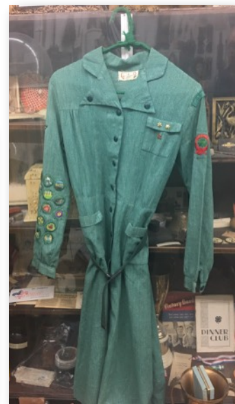
Left to right: Homemade mousetrap, 1936 Johnson Seahorse shipping box, watercolor of Green Mountain School, 1948 Girl Scout uniform.