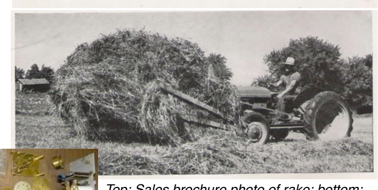
Top: Sales brochure photo of rake; bottom: hay rake in use; right: Pigeon race timing clock intact and in pieces.