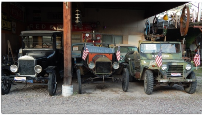
Part of our stable of rolling stock, from which David Bosley, Gil and volunteers drive in parades.

The Model T at center is started with an engine crank, typical of the era. The Jeep was one of four vehicles we drove in the 2015 Memorial Day Parade in Polson.