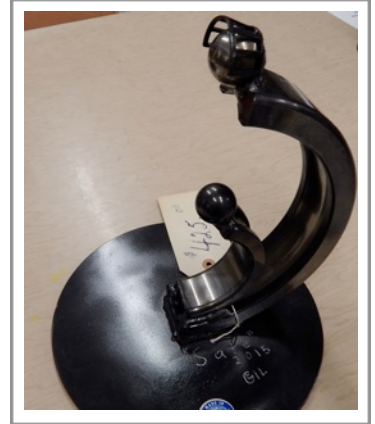
Sculptures “Race to the Top,” “Safe” and “Rhumba” (lower right.)

Another way I try to raise funds for the museum is with my whimsical metal sculpture art made from repurposed items. The pictures really don’t show them well. You will see them better by enlarging them online, or at the Museum.