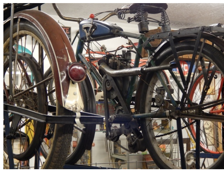
Whizzers--foreground-- 1948, background--1939