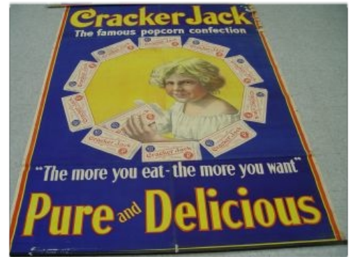
It's hard to show the impact of this nine-foot-tall Cracker Jack poster in a photo. It is scheduled for restoration to its original grandeur.