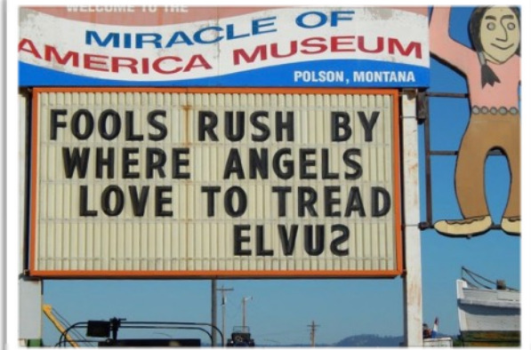
Adding a bit of humor to our invitation, we paraphrased a line from an old Elvis song.