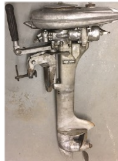
Left to right: Saddle in front of the reconstructed Welch Saddlery; rope-start Sea King outboard, 1930 Marx toy typewriter, 1930 cap gun, shown with bill to indicate size.